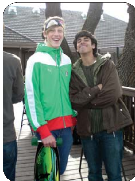
El Dorado Hills youth enjoy the community's new skate park, which opened in January 2007.